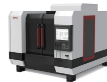
CNC table for frame grinding and precision milling