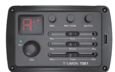
Trumon Smart Equalizer 1.0 (Optional )