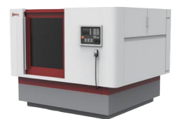
-Inlay type rosette precision carving machine-