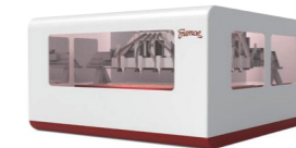
Sound board processing center