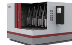
Bridge precision milling machine